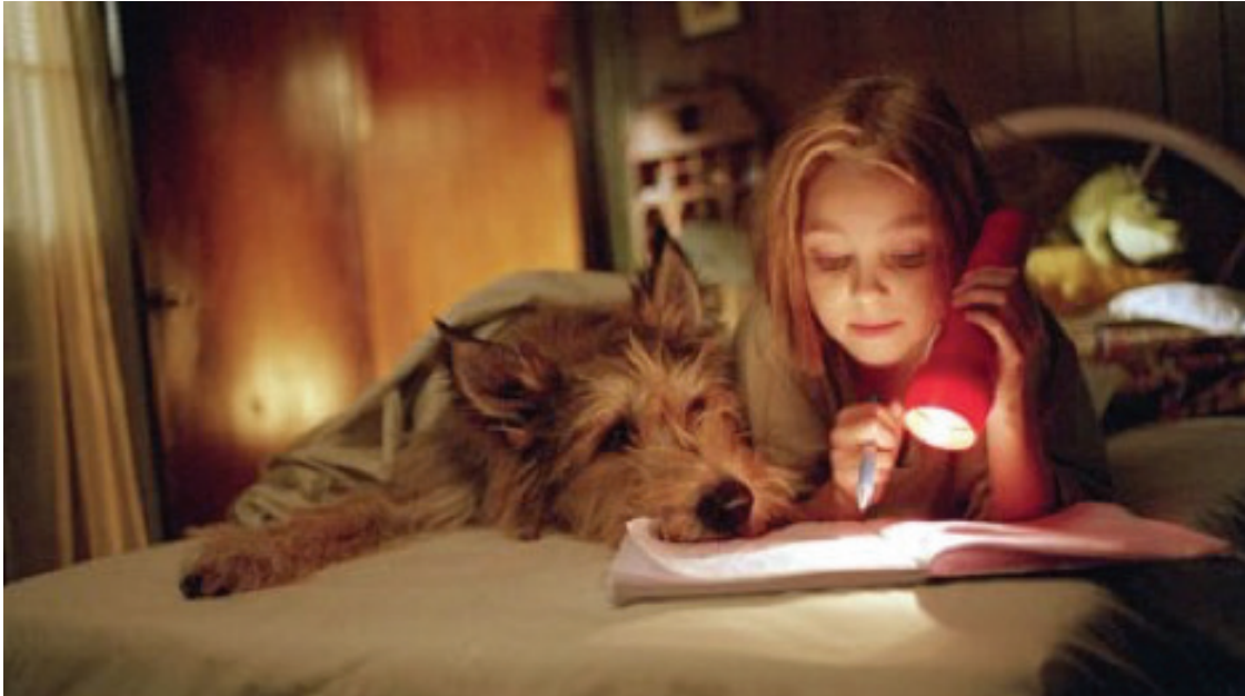
Because of Winn Dixie