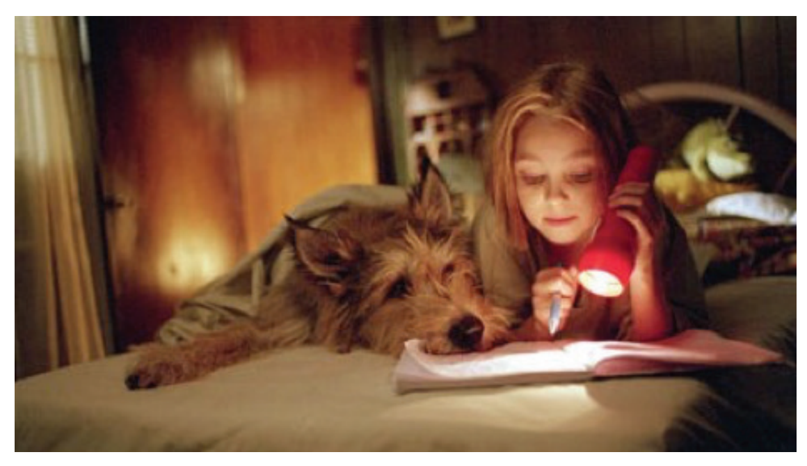
Because of Winn Dixie