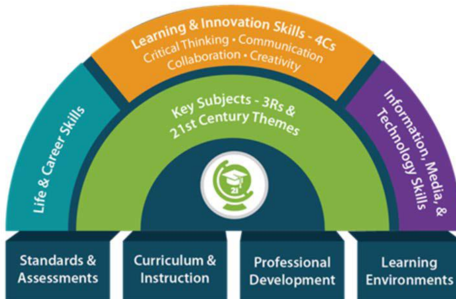
Figure 5. 21 st Century Learning

The 21 st century classroom also requires teachers who are facilitators and understand how to guide students in their pursuit of knowledge. These teachers recognize the need for student choice and engagement. They provide opportunities for students to work independently, in small groups, as well as in a large group. Effective teachers in 21 st century classrooms also understand how to engage students and structure activities that help them develop resiliency. They understand how to orchestrate learning that promotes the 4Cs: critical thinking, communication, collaboration, and creativity. In the graphic below, we present a Framework for 21 st Century Learning that describes the importance of these 4Cs and how they can influence teaching practices ( http://www.p21.org ).