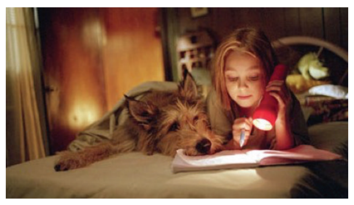
Because of Winn Dixie