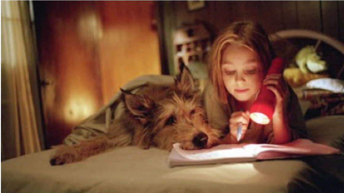
Because of Winn Dixie