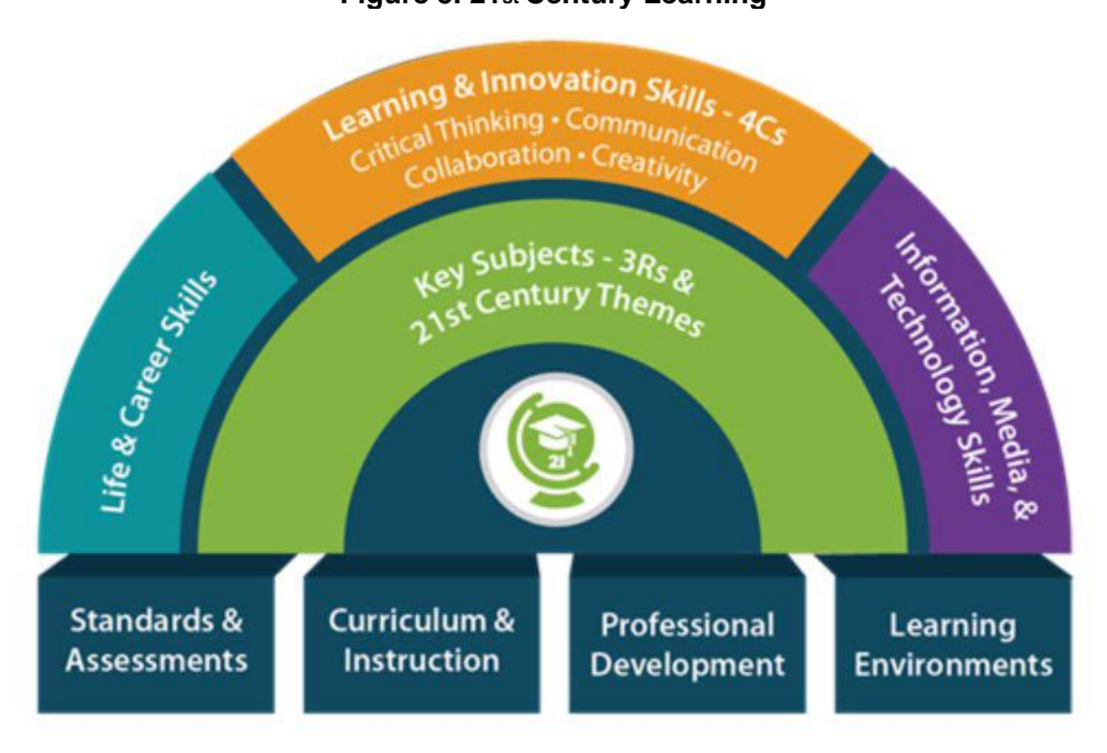
Figure 5. 21st Century Learning

The 21<sub>st</sub> century classroom also requires teachers who are facilitators and understand how to guide students in their pursuit of knowledge. These teachers recognize the need for student choice and engagement. They provide opportunities for students to work independently, in small groups, as well as in a large group. Effective teachers in 21<sub>st</sub> century classrooms also understand how to engage students and structure activities that help them develop resiliency. They understand how to orchestrate learning that promotes the 4Cs: critical thinking, communication, collaboration, and creativity. In the graphic below, we present a Framework for 21<sub>st</sub> Century Learning that describes the importance of these 4Cs and how they can influence teaching practices (http://www.p21.org).