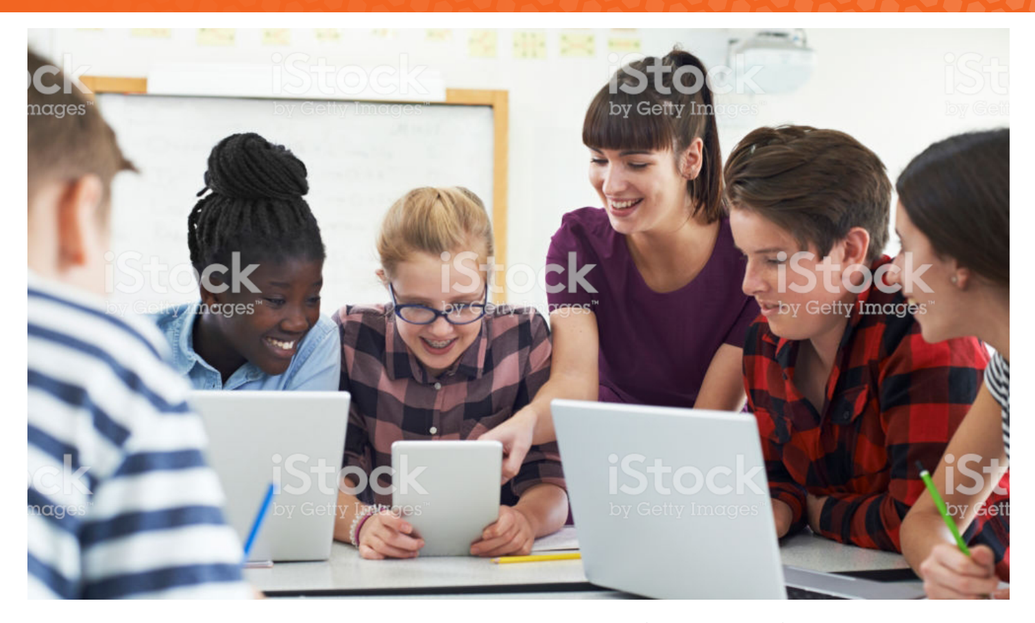
Pennsylvania Department of Education, Office of Commonwealth Libraries. (2014, September). The model curriculum for Pennsylvania school library programs (M. K. Biagini, et al., Authors). Retrieved from Pennsylvania School Librarians Association website: <a href="https://www.psla.org/model-curriculum-for-pa-school-library-programs">https://www.psla.org/model-curriculum-for-pa-school-library-programs</a>