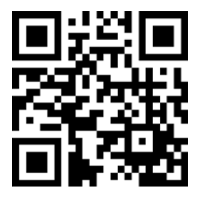
Pennsylvania School Librarians Association Website