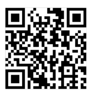
American Association of School Librarians Best Apps for Teaching and Learning