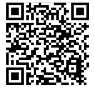
Americans With Disabilities Act (ADA)