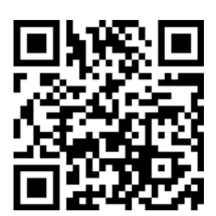
American Association of School Librarians Best Websites for Teaching and Learning