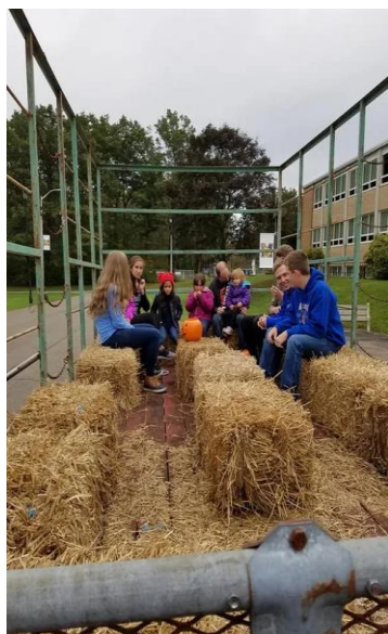
Kids from the school and community kids on the hayride that was offered at the fall festival.

Pumpkins, Candy Corn, Haunted houses, hay rides... oh my! This year at Marian Catholic the school added a new fall event to the many Marian events that happen during this season, the Annual Campaign Kickoff Fall Festival. This event took place on October 14, 2018 in the Marian gym. The event was on a beautiful fall day, a nice day to enjoy with the family. The fall fest offered many different activities such as vendors, hay rides, yummy fall foods, tricky trays and crafts. There were many different vendors at the fair such as bows, jewelry, thirty-one and so much more. This let the vendors get to show some of there fall items off to the community. The event also offered a hay ride around Marian to everyone who attended the festival. They hope to have this event next year as a nice day out on a fall afternoon for fall fun.