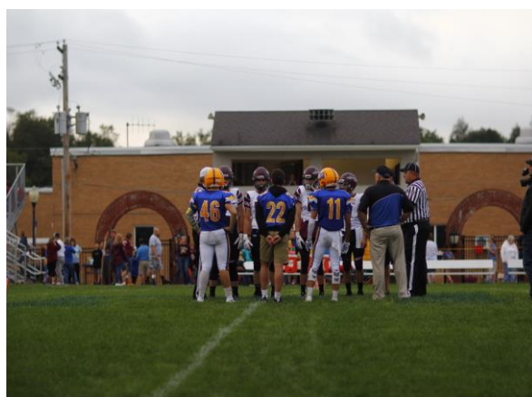
Week 9 coin toss