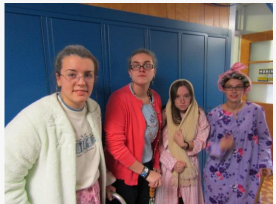
I didn't know the elderly attended Marian Catholic!?