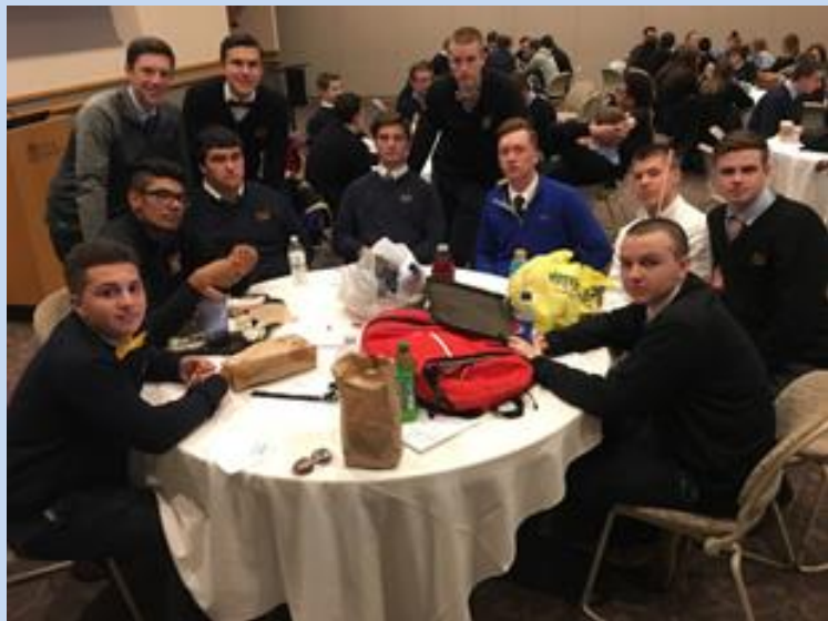
Lunch being enjoyed on the DeSales University campus while seniors are visiting on their annual retreat