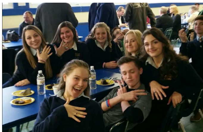
PROUD JUNIORS show off their new class rings at the reception held after the Unity Mass.

On November 16 th Marian Catholic High School held their annual unity mass for the junior graduating class of 2018. During the mass the juniors received their class rings. Family and friends were welcome to celebrate the accomplishment with the rest of the school. Following the mass was a reception for the juniors and their friends and family. The class ring is a symbol of unity within the class and is a reminder that the juniors are not only a class but a family. The juniors now have a reminder of their connection with their fellow classmates and the Marian family. Congratulations to the junior class on their almost fulfilled journey through high school. The Marian Catholic community is very proud of each and every one of you.