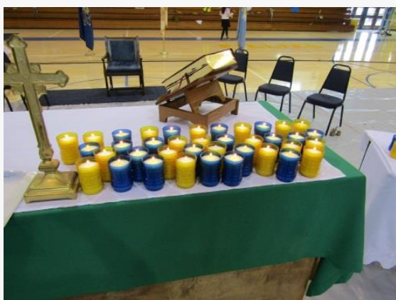
Candles on the altar at mass on All Saints Day to Memorialize our recently deceased.

On November 1 st , All Saints Day, Marian Catholic High School held a memorial mass for all deceased members and relatives of the Marian family. This mass is special due to the focus on the deceased and praying for a happy after life for them. In the mass we say the names of the deceased and allow their family members to light a candle in their honor. The candle is placed on the altar. We celebrate it every year on November for All Saints which makes the day holier and boosts the chances of their prayer to assist the deceased in getting to Heaven.