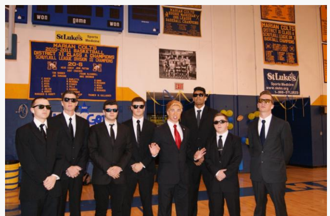
President Elect Donald J. Trump and his secret service visits a supporting school.