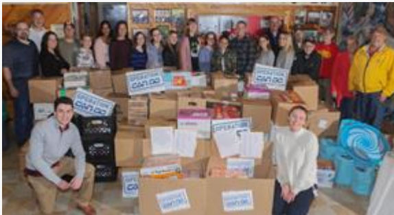
Pictured is the final result of donations collected all across local schools and businesses.