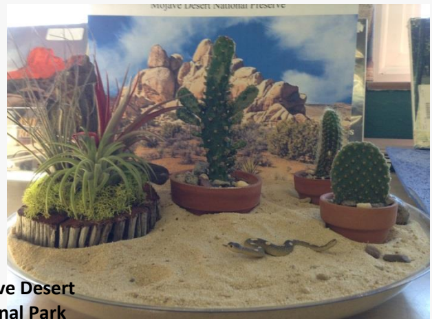
Mojave Desert National Park