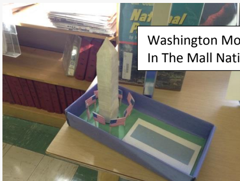
Washington Monument In The Mall National Park