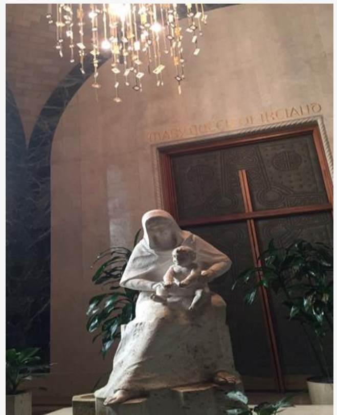
A side shrine for Mary. Here she is holding Jesus. This is also a fountain.