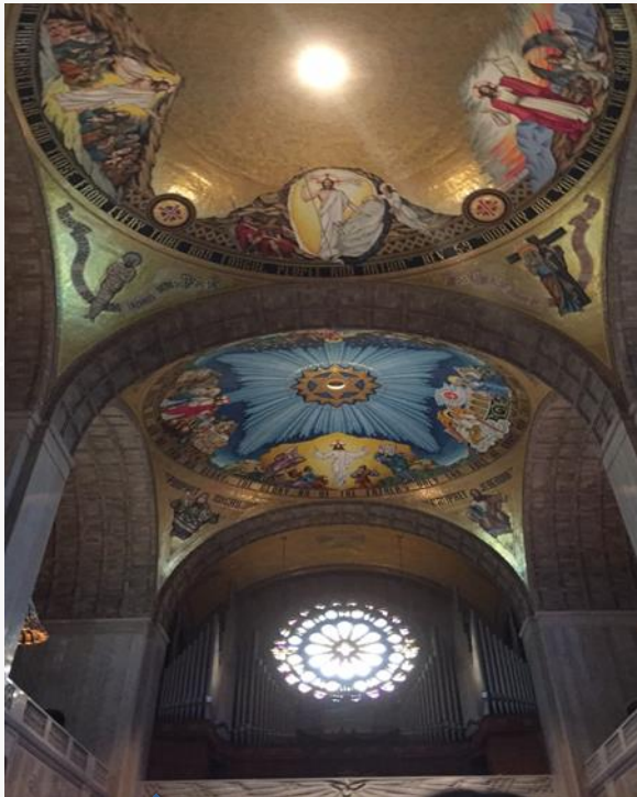
Ceiling Mosaic in the main Chapel.