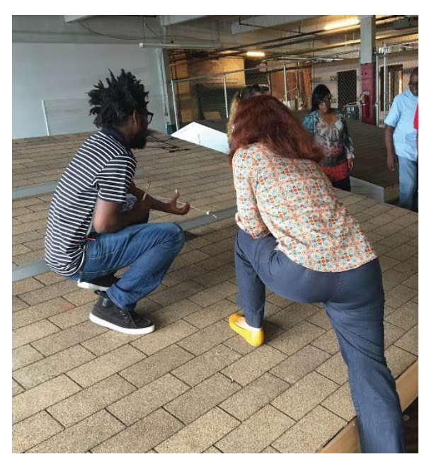
From experiencing solar installation practices to learning how to use a ladder, this site visit reviewed solar energy practices, applications, certifications, and occupations.