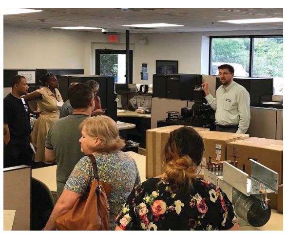
The group toured Johnson Controls and explored the content knowledge and diverse skill-sets required for working in the heating and cooling industry.

Through exploring three-dimensional models, computer graphics, traditional blueprints, and a construction site, educators experienced the creation of Penn's Pavilion (hospital) Project.