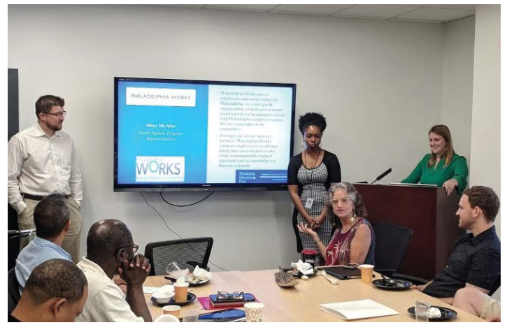
The educators met project staff and one another, reviewed the upcoming program, and discussed their goals for participation.

The overarching goals of this innovative program were to introduce educators to the content knowledge and skill-sets needed for a wide variety of STEM occupations.