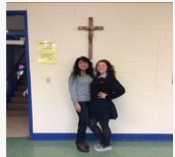
MOM comes to Marian to see her daughter get a class ring.

MARY our mother is a icon at Marian Catholic High School, every year we have the May Crowning, she gives us love. For mother's day we should keep her in our hearts.