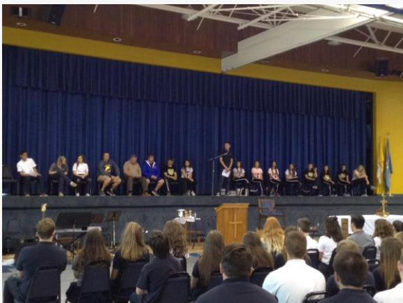
PEP Rally for Track and Field

Track and field were looking to break records as they went to states. Like Marian always does, the school and students showed support for the 13 athletes who competed in states at a pepe rally on May 25. That wasn't all for these athletes, they also received letters and inserts for their letterman jackets. I am sure I speak for every Marian member when I wish them the best of luck!!!