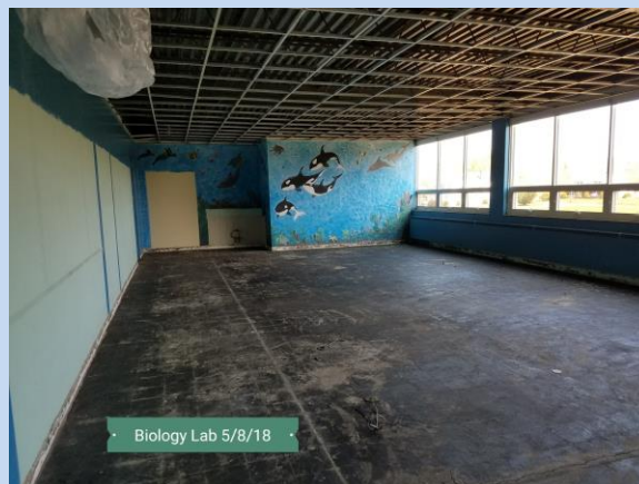
Biology Lab 5/8/18