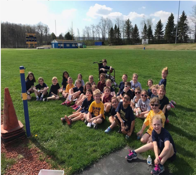
CHILDREN from Saint Jerome's seen above after participating in the annual 'Race for Education'. The annual walk is held here on Marian Catholic's track.