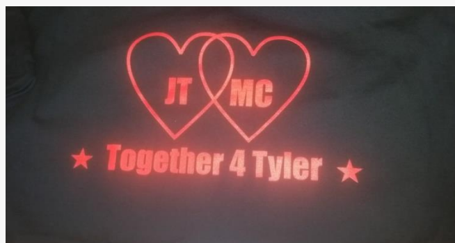
A PICTURE of a shirt from the T-Shirts For Tyler fundraiser. The design was thought up by those in the Student Advocates For People with Disabilities. It was meant to show that even though our schools are rivals in sports we can still come together for a greater good.

T-Shirts For Tyler sold approximately 202 shirts raising over $1000 with some money coming from the Jim Thorpe area as well as from donations from individuals who didn't purchase a shirt. Those involved in the fundraiser encouraged all students to sign a trifold. The signed trifold is going to be presented to the family of Tyler Kowatch along with a picture of all the students who had purchased a shirt wearing them as well as a check for the total amount of funds from the shirt sale.