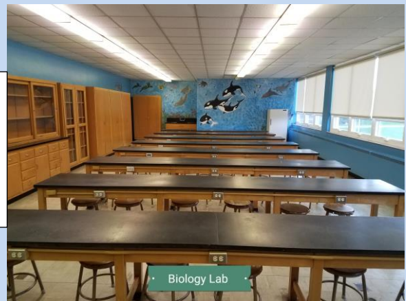
Biology Lab 4/27/18