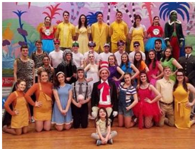
CAST of Seussical poses for a picture in celebration of a job well done. The performers blew the audience out of the water.