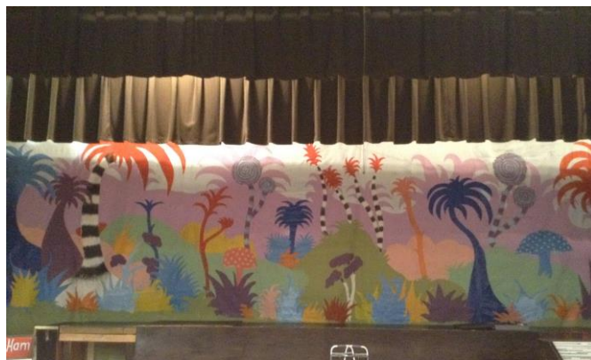
FANTASTIC backdrop for Seussical. Looks just like it came out of one of Dr. Seuss' books.