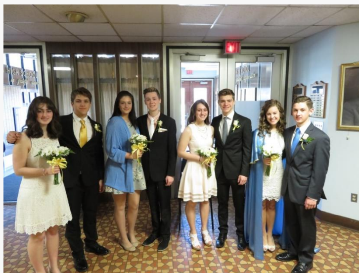
THE May crowning court smiles in happiness as they get ready to crown Mary during Marian’s May Crowning ceremony.