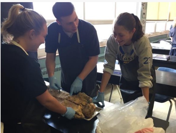
DISSECTING Mr. Bigglesworth. Marian seniors dissect Mr. Bigglesworth to get a better understanding of anatomy on May 3.