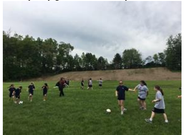
ST. JEROME'S second graders are playing soccer on the Marian Catholic football practice field. The kids had so much fun playing soccer with their friends!