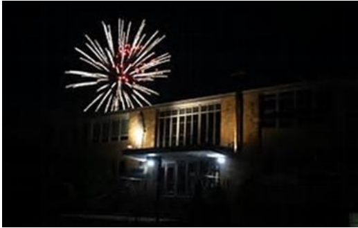
FIREWORKS shown over the front of the Marian building