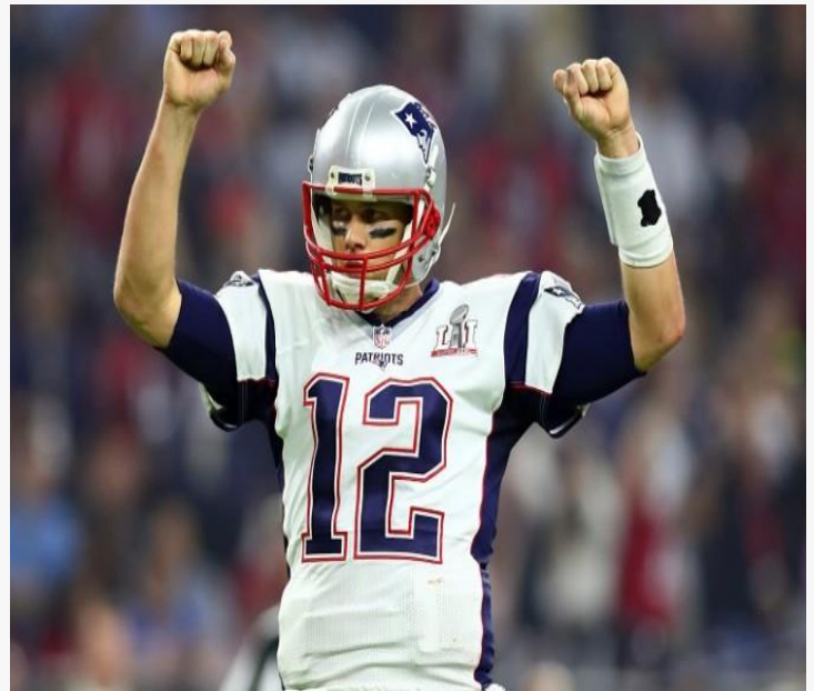
Tom Brady celebrates after a Patriots touchdown in Super Bowl LI