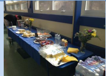
Faculty Lunch Buffet sure looks good

nuns from IHM come to get the goods that the students donated to the nuns. The students that were chosen for Teacher of the Day were to teach their class.