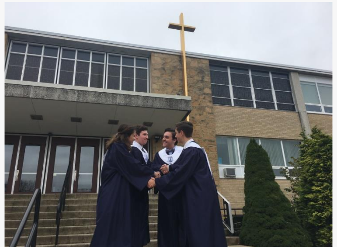
The NHS officers get psyched for the induction mass.