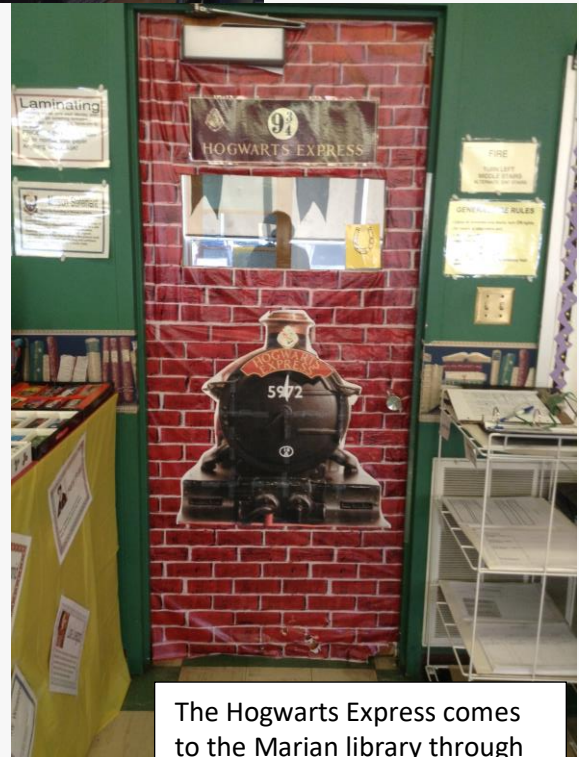
The Hogwarts Express comes to the Marian library through Platform 9 ¾.