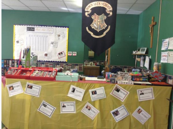
Library desk has many great Harry Potter quotes as well as the Hogwarts shield hanging over head.