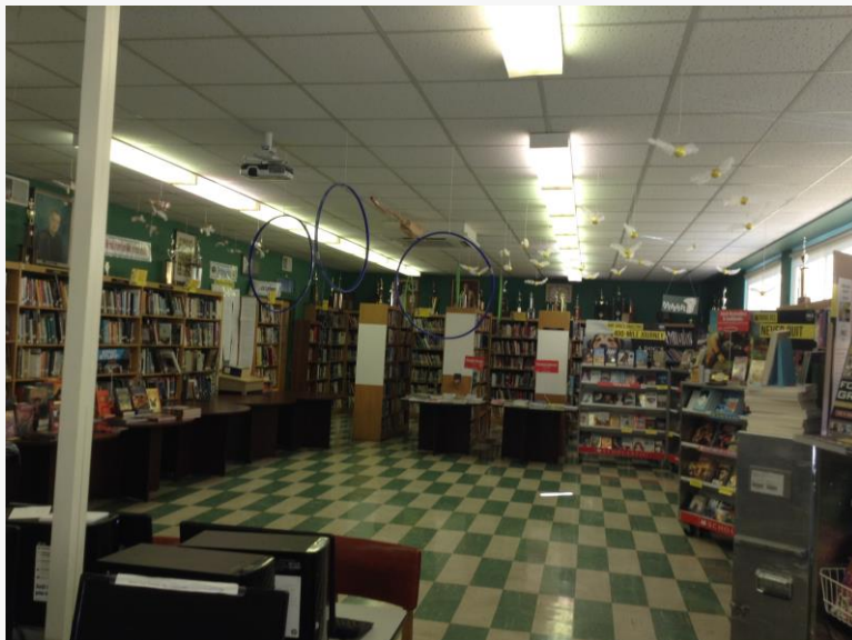
The Marian library was fully decorated for Harry Potter starting with quiddich hoops and flying snitches. The flying keys are from The Sorcerer's Stone and of course the Nimbus 2000 broom used for all.