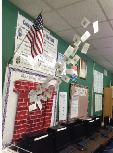
Mail delivery Hogwarts style, at least when the Dursleys won't let Harry have his letter.