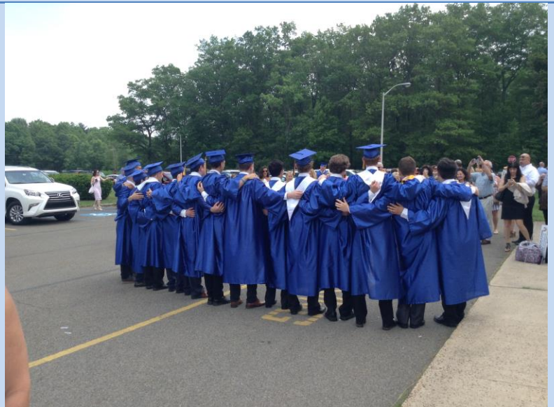
SENIORS say goodbye and leave Marian as they graduated but they really never turn their backs on their high school days here at Marian