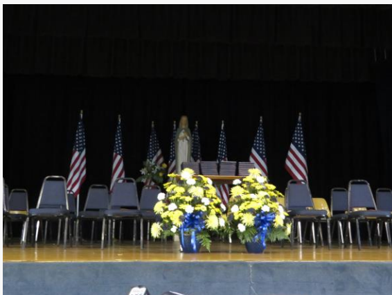
MARIAN'S stage set up for graduation ceremonies on June 2, 2018

This day marks the end of high school and the first day of the rest of our lives ( I know that is a cliché but it fits ). We are entering into the big unknown as little fish in a big sea.