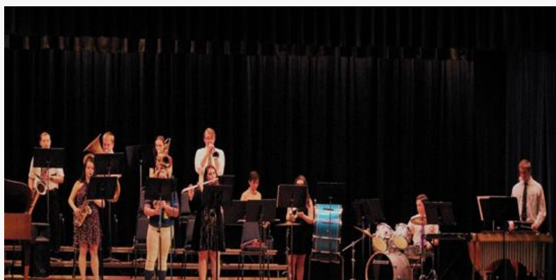
CONCERT band performing Grabbin Some Air Wednesday May, 23rd at Marian.