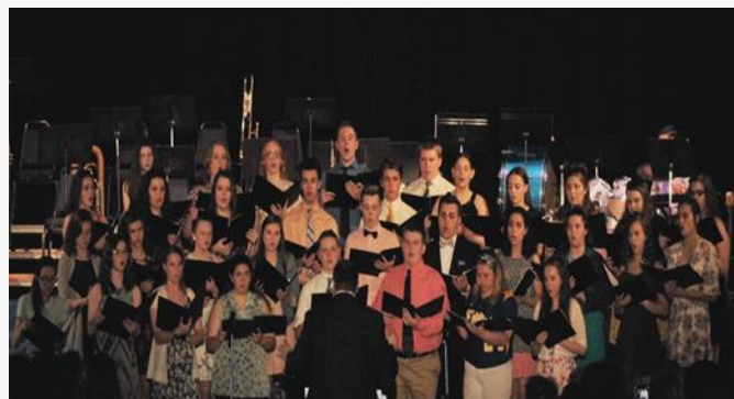
CHORUS performing Skyfall on Wednesday May, 23rd in Marian Catholic Auditorium. The harmonies were just wonderful. Good job folks!

It was a wonderful night of music showing that Marian has talent in all areas. They are a small group but mighty